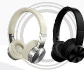
Lenovo Yoga Active Noise Cancellation Headphones