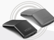
Lenovo Yoga Mouse with Laser Presenter