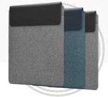
Lenovo Yoga Sleeve